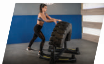
PATENTED DESIGN ALLOWS USERS TO STEP AND FLIP