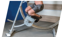
FREE SWIVEL SEAT TO WORK THE OBLIQUES