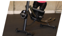
SWIVEL SEAT DESIGN TO WORK OBLIQUES