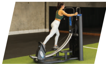
TOTAL LOWER BODY WORKOUT