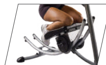
SWIVEL SEAT DESIGN TO WORK OBLIQUES