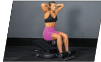
DESIGNED TO PUT YOU IN THE PERFECT SQUAT POSITION