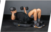
INCLINE BENCH ATTACHMENT ALLOWS FOR UNLIMITED EXERCISES