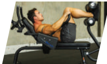
DOUBLE CRUNCH DESIGN