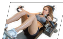
PERFECT CRUNCH DESIGN