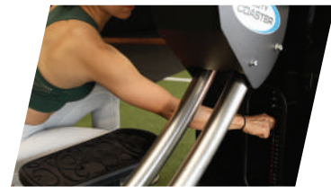
SELECTORIZED WEIGHT RESISTANCE UP TO 170 LBS